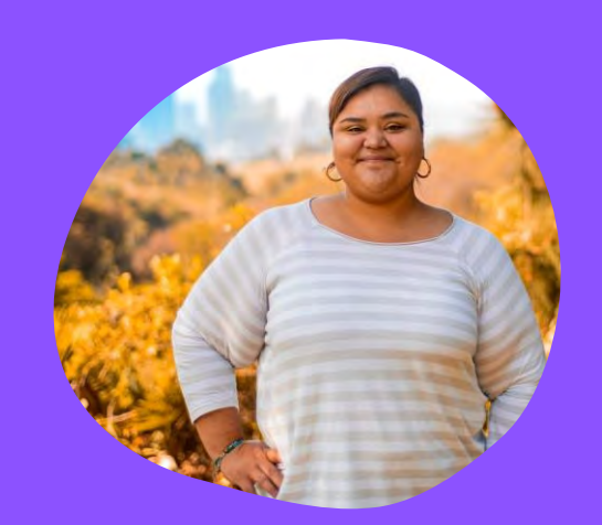
EUNISSES HERNANDEZ Councilmember District 1