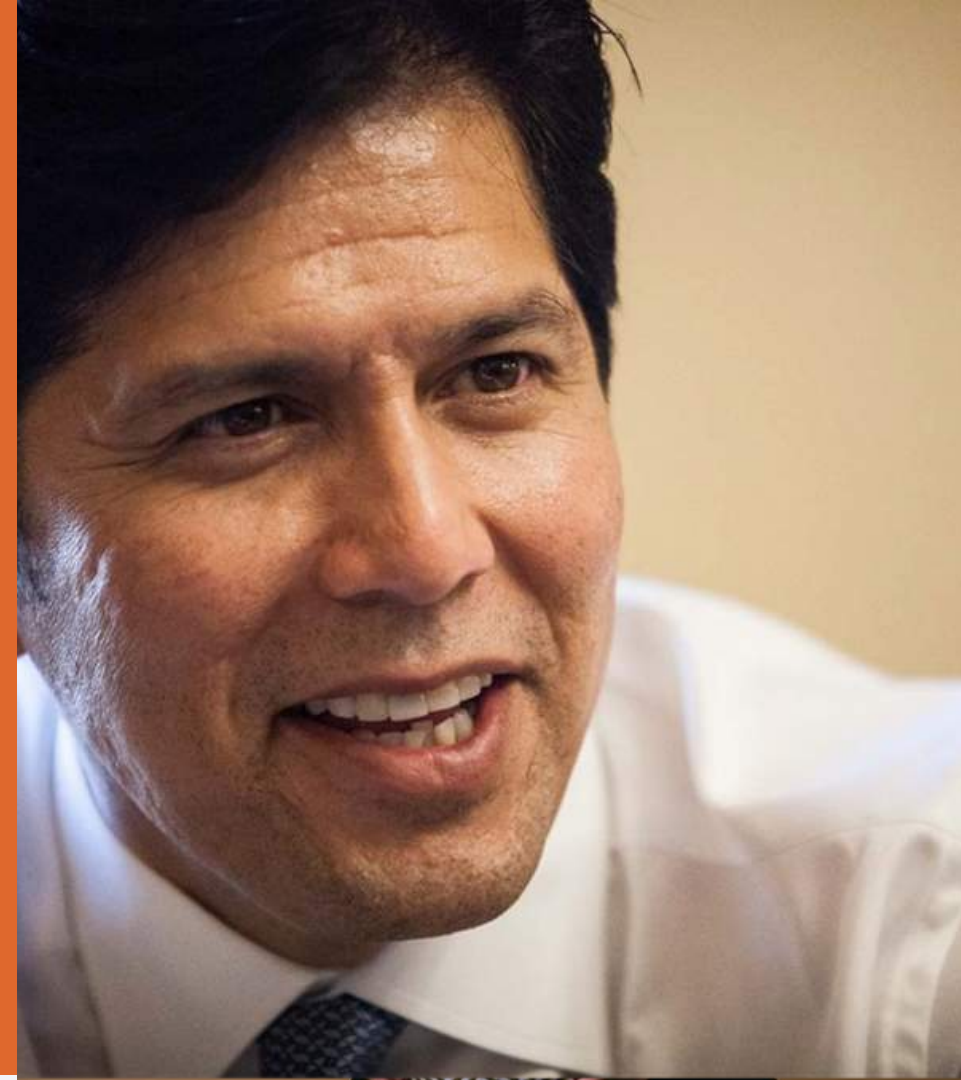
Kevin de León